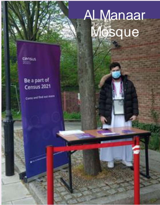
Al Manaar Mosque